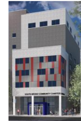
South Bronx Community Charter High School