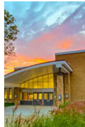
Harrison High School