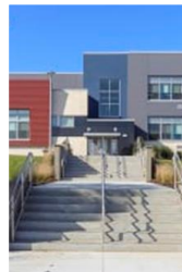
Louis M. Klein Middle School