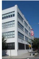
Baccalaureate School for Global Education