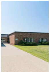
Questar III BOCES Robert A. Gibson Technical High School