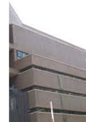
Urban Assembly Maker Academy