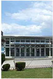
Thomas A. Edison CTE High School