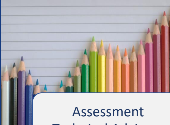
Assessment Technical Advisory