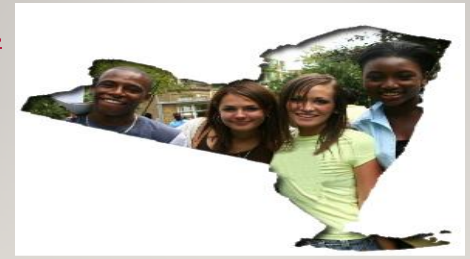
NYS STUDENTS THANK YOU