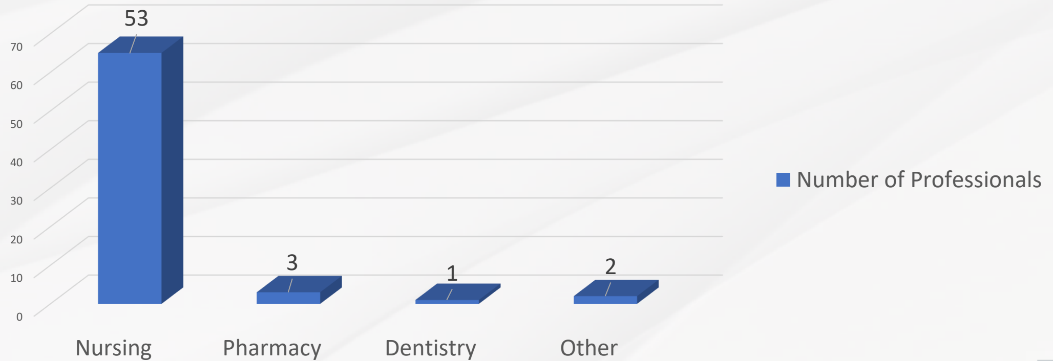
2024- Professional Admissions in the PAP