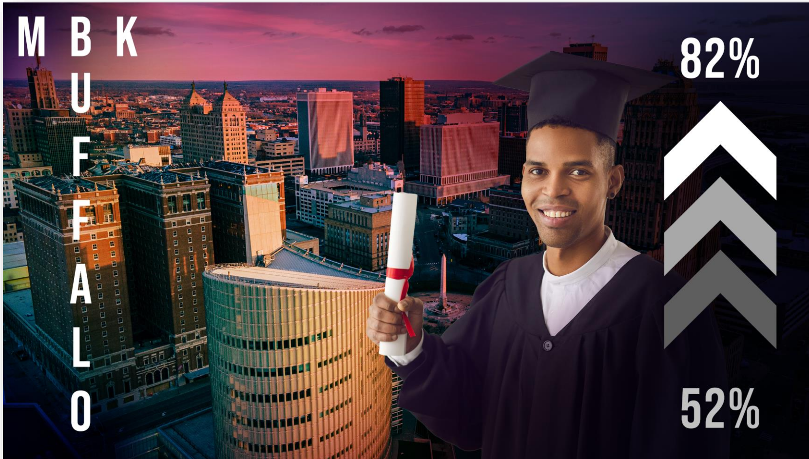
Buffalo MBK Graduation Rates for Native Americans from 2016-2021