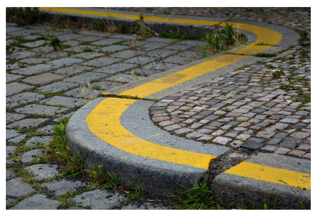
"Sidewalk Curb"