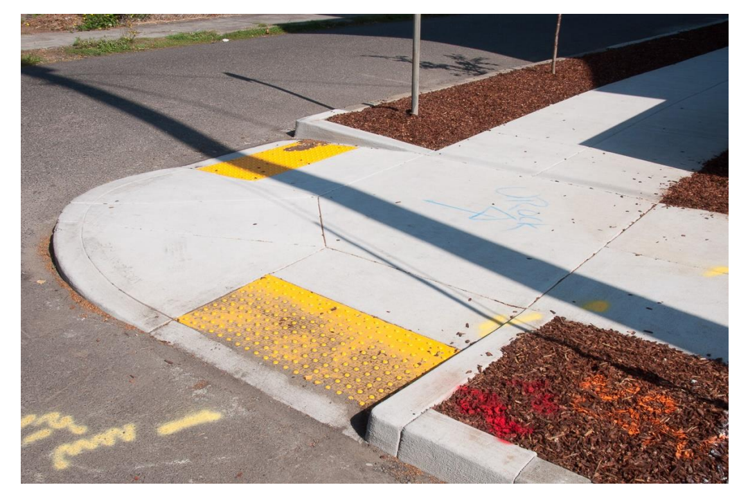
"13544" by <u>Dylan Passmore</u> is licensed under <u>CC BY-NC 2.0</u>