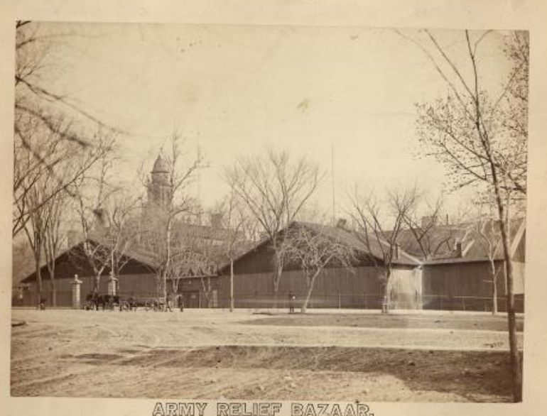
ARMY RELIEF BAZAAR,