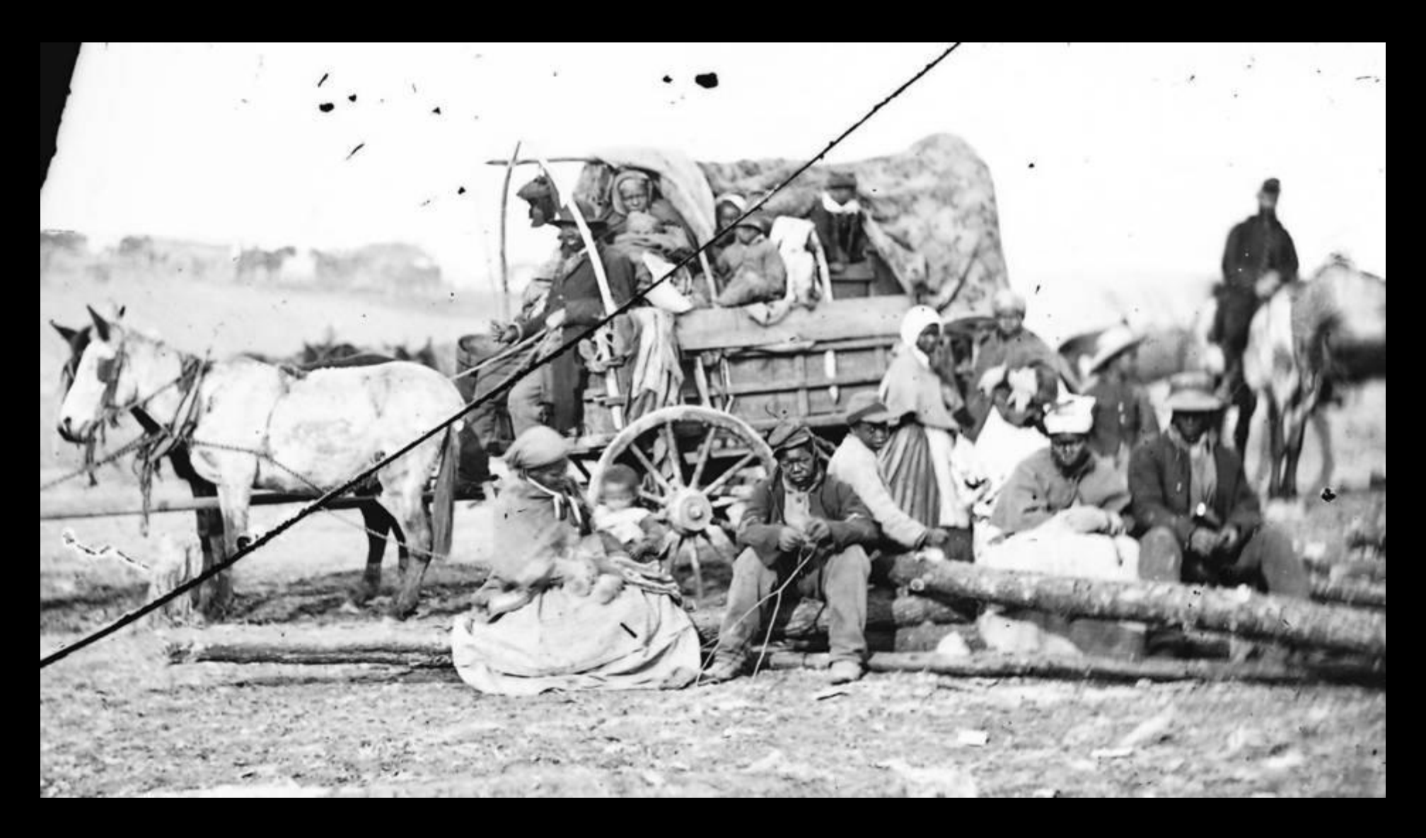
1863 photo shows an extended family of contraband slaves after their escape into Union lines (LOC)