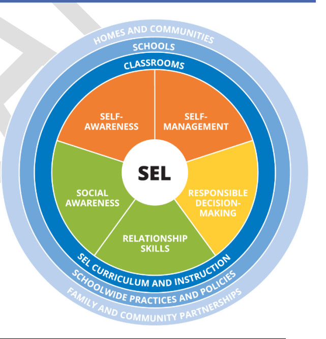
Figure 1: Framework for Systemic Social and Emotional Learning. ©CASEL 2017

There are many frameworks and ways to talk about social emotional competence and skills. For simplicity and clarity, this document uses a set of five competencies, identified by the Collaborative for Academic, Social, and Emotional Learning (CASEL) that all young people (and adults) need to learn to be successful in school and in life. This framework has been widely accepted across the country.